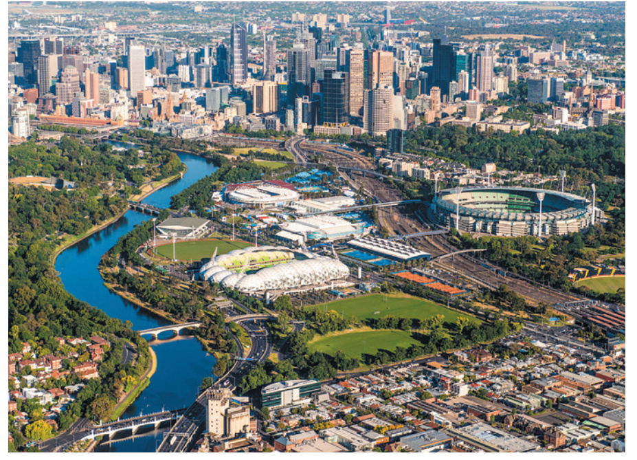
Equipping cities to weather our changing climate takes many disciplines working together.